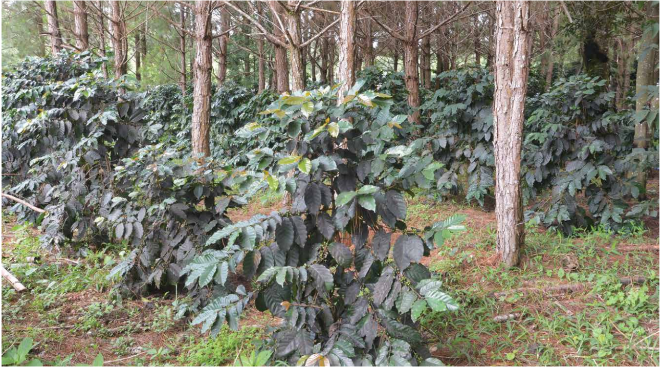
Coffee bushes in a shade-grown organic coffee plantation