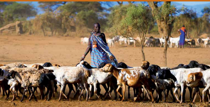
Masai shepherdess, Kenya