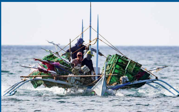
Indigenous fishing craft of the Philippines

performance of the financial institution's portfolio, and advance strategic changes aiming at de-risking and/or maximising potential positive impact. The middle management typically coordinates between the strategic guidance mandated by senior management and actual implementation of actions. This is done by a social and environmental or sustainability manager. Specifically, the position provides advice and support to loan officers involved in client social and environmental assessments and monitoring. The position also improves the tools and procedures based on feedback from the daily users within the institution. On an operational level, loan and credit officers are in charge of assessing and monitoring social and environmental performance of individual clients.