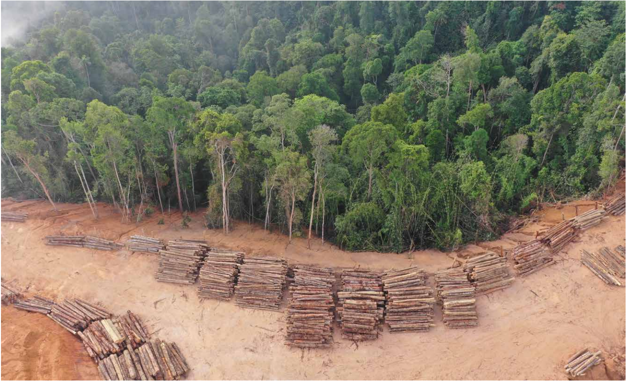
Aerial drone view of deforestation, environmental problem in Malaysia