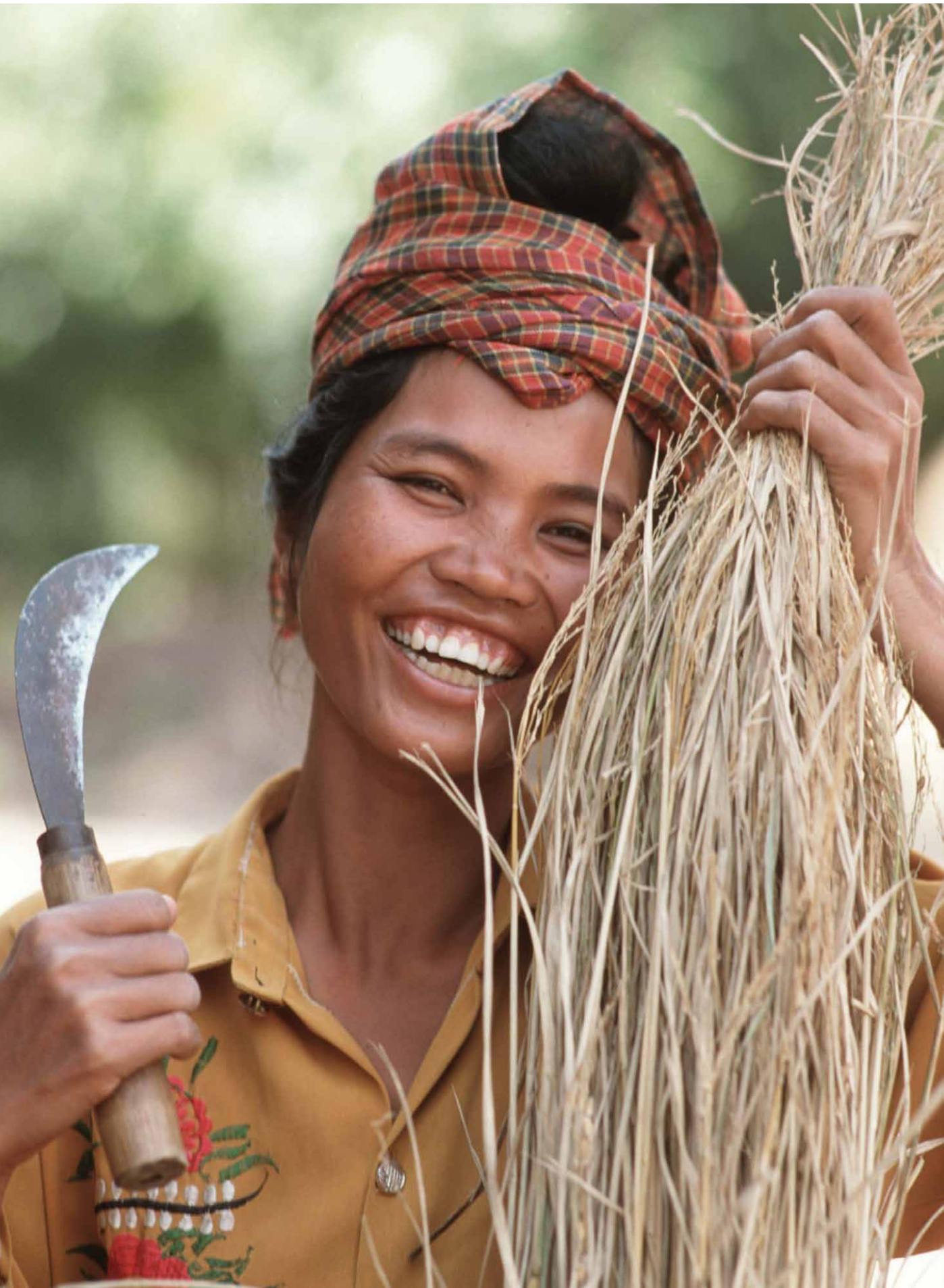
Photo: Woman cutting hay for cattle.